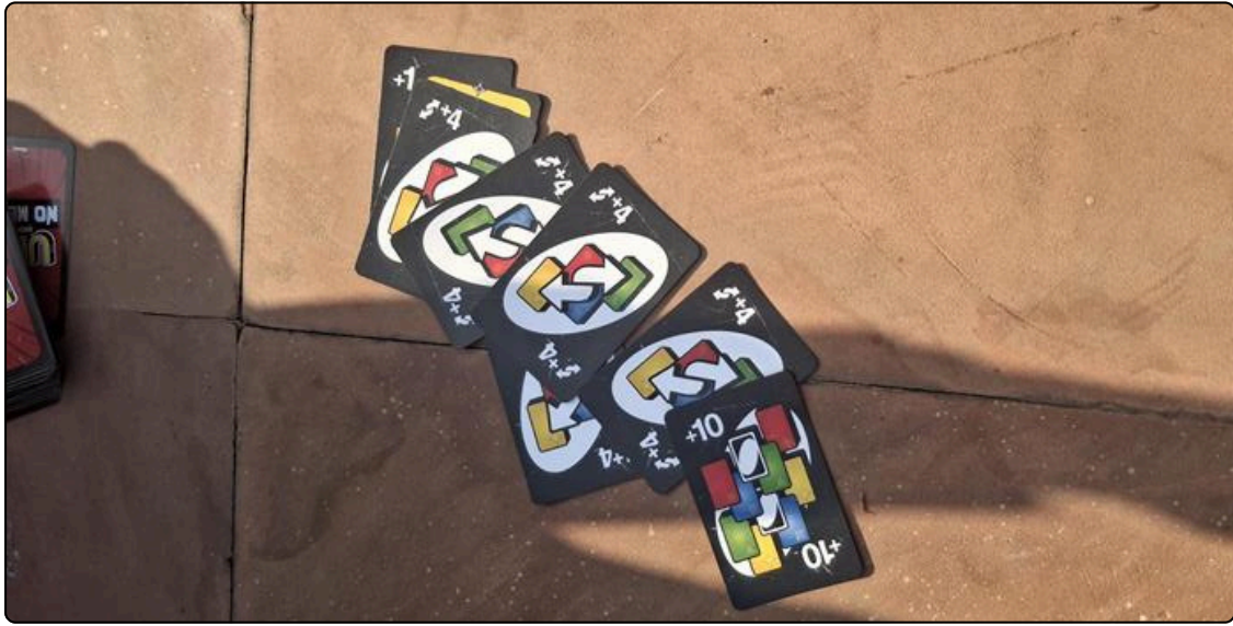
Moment Of The Month